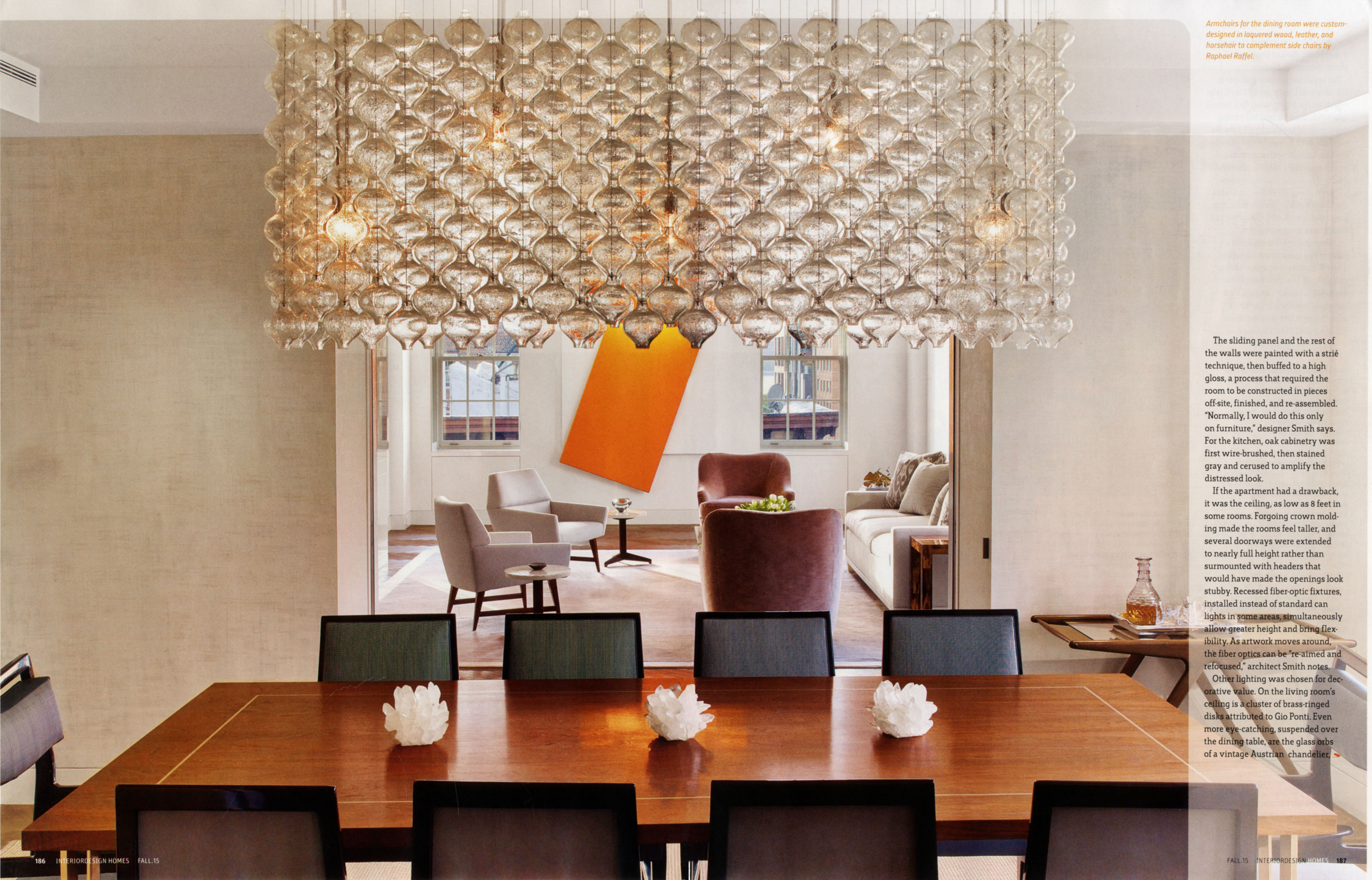
Armchairs for the dining room were custom-designed in laquered wood, leather, and horsehair to complement side chairs by Raphael Raffel.

The sliding panel and the rest of the walls were painted with a strié technique, then buffed to a high gloss, a process that required the room to be constructed in pieces off-site, finished, and re-assembled. "Normally, I would do this only on furniture," designer Smith says. For the kitchen, oak cabinetry was first wire-brushed, then stained gray and cerused to amplify the distressed look.